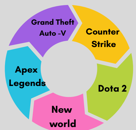
Games commonly played on steam